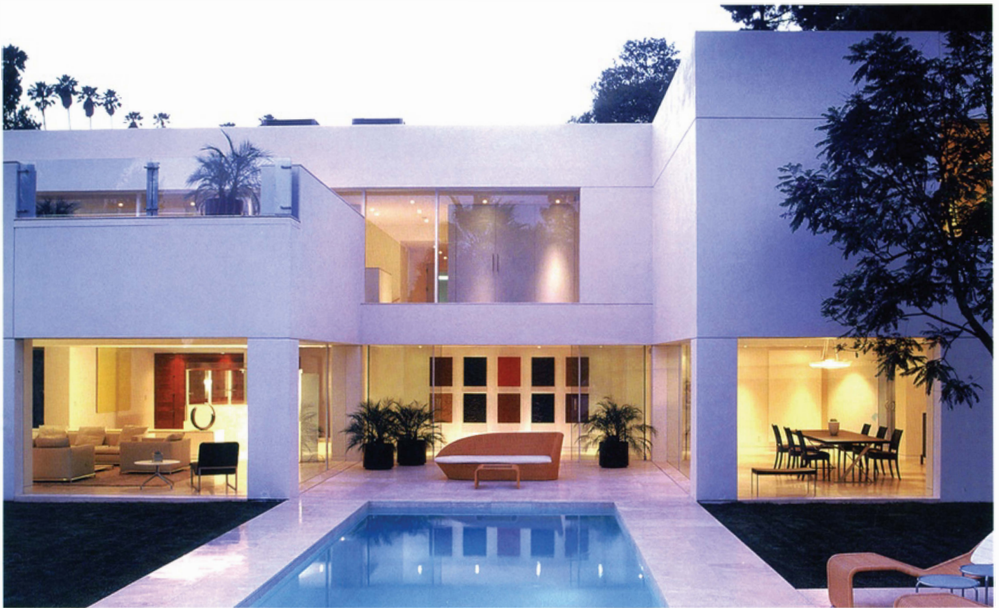
The homes featured for this cover story, are taken from a selection of custom homes built by Dugally Oberfeld, LLC.